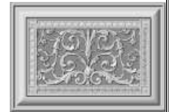
available in Louis XIV style