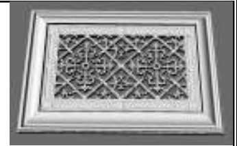
perspective view of FV-209