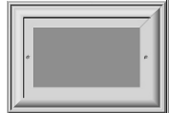
Base piece with out grille