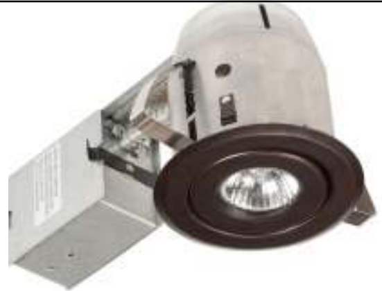
Globe Electric 3 inch remodeling canister with bronze gimbal trims

Commercial Electric 3" LED remodeling canisters