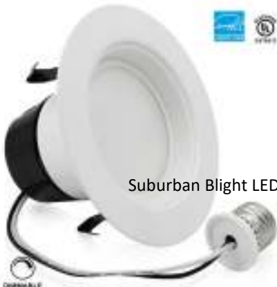
Suburban Blight LED 3 Inch Retrofit