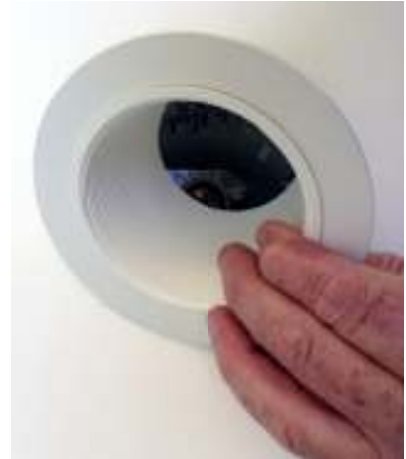
Next remove the Trim Piece by pulling straight-out, don't twist