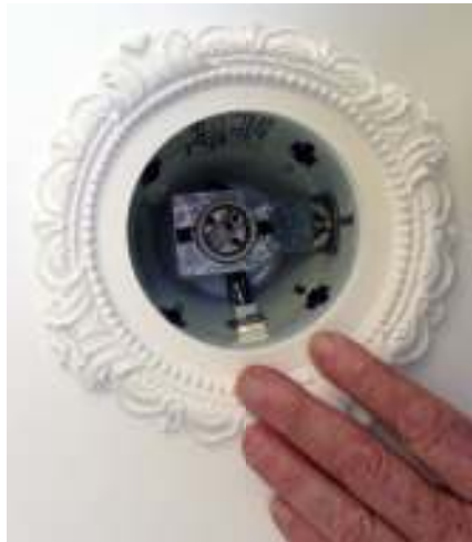
Then place the Beaux-Arts' decorative medallion over the canister