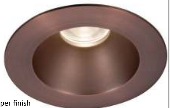
WAC HR-3LED In copper finish