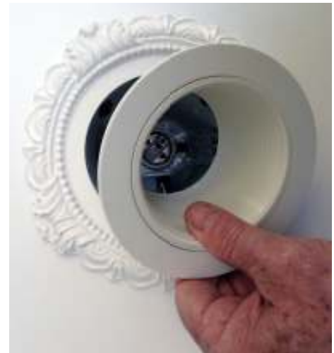
Next replace the Trim Piece by pushing it through the decorative medallion directly into the canister. Push straight-up, and don't twist