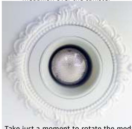
Take just a moment to rotate the medallion so the points are parallel to the walls