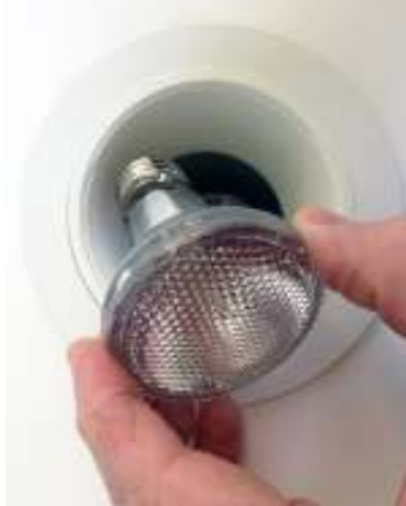
First remove the light bulb