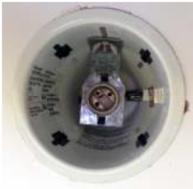
This is what a 3" recessed light canister looks like with no trim