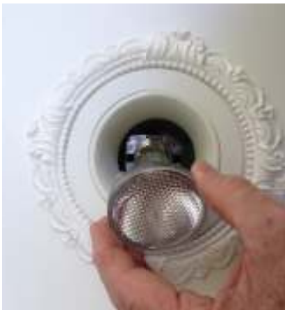
Lastly replace the light bulb