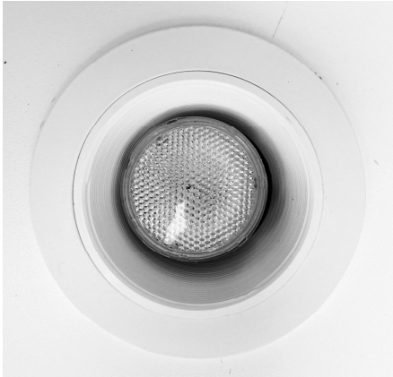
This is what a 4" recessed light looks like