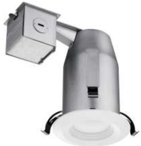
Lithonia 3 Inch LED LK#BPMW

The LR-131 Victorian decorative trim fits with either a new a 3" LED Recessed Trim, or a Traditional 3" Recessed Trim