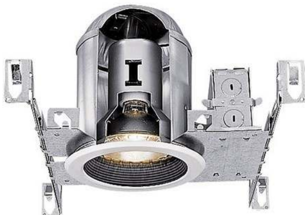
The Halo H5 Air-Tite trim

as seen above is not necessary when using the new type LED Retrofit Baffle Trims