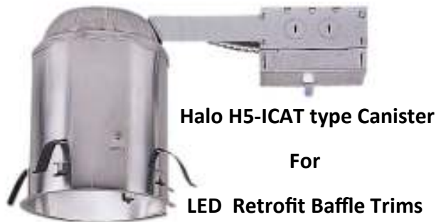
Halo H5-ICAT type Canister