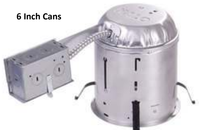
Halo H-7 type Remodeling Canister