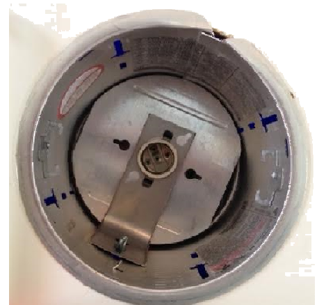
Halo H-7 type Canister